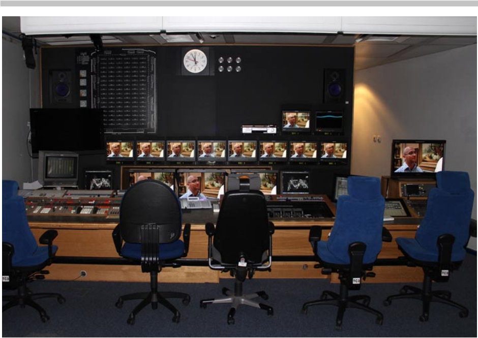
Control desk from front

gigabit/s HD-SDI operation, adds ATG Danmon Projects Manager Dave Whitaker. "The main vision mixer was equipped with fibre-optic feeds from Sony HDC 1500 cameras. Other infrastructure incorporated included a Snell Cygnus router, Crystal Vision signal converters and additional glue equipment. Several of the existing production control desks were modified to incorporate additional equipment panels. We also reworked some of the Custom Consoles LCD-panel monitor stacks."